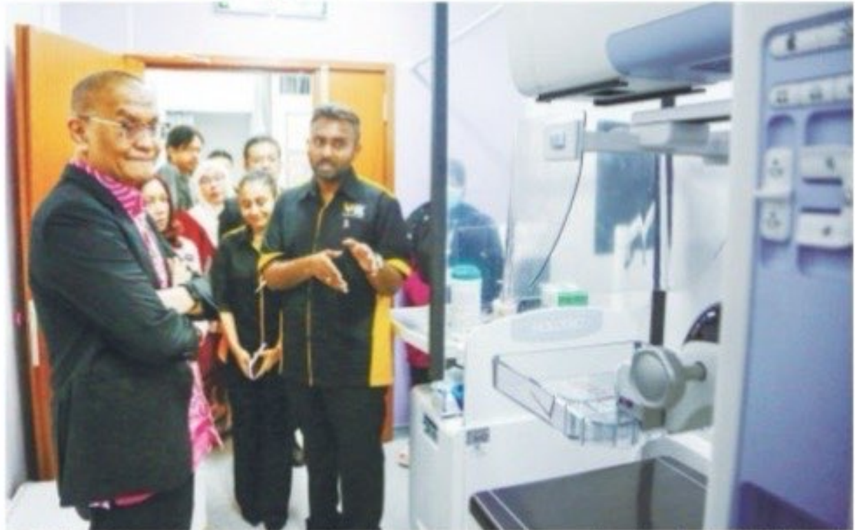
Dzulkefly (left) attending the inauguration of Breast Cancer Awareness Month at the Health Ministry in Putrajaya yesterday.

Dzulkefly highlighted the rising trend in cases, namely 18,206 new cases in 2007-2011, 21,634 in 2012-2016 and 29,534 in 2017-2021.