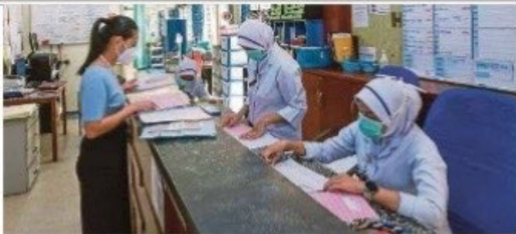
Fasa pertama Sistem P3S dibuka kepada skim jururawat di bawah Bahagian Kejuruteraan.