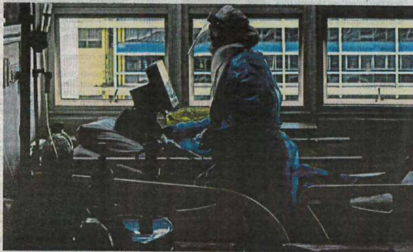
A good system will help the Health Ministry resolve medical manpower issues.

T HE Health Ministry can learn from the paediatric fraternity, who virtually solved their manpower distribution with an ingenious data-driven, doctor-to-workload solution, which can be improved, refined and digitalised for other disciplines.