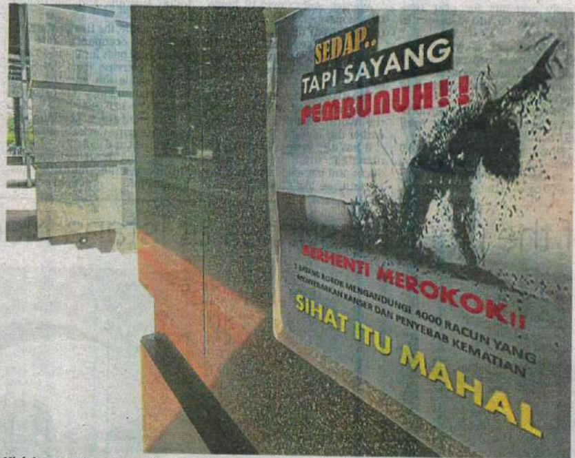
Kick it out: A 'Stop smoking' poster in Kuala Lumpur.

With the advent of innovative nicotine vaping products, which include heat-not-burn products,