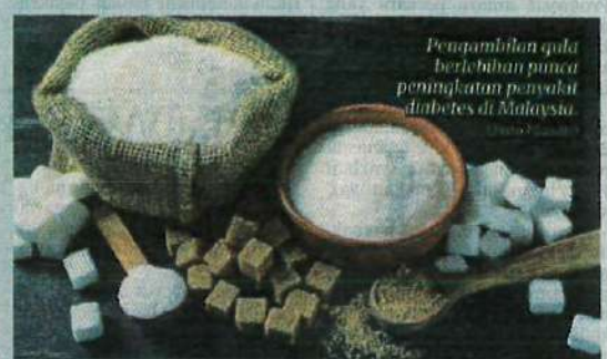
Pengambilan gula berlebihan punca peningkatan penyakit diabetes di Malaysia.

"Semua pihak harus terima hakikat budaya pengambilan makanan di negara ini sebenarnya