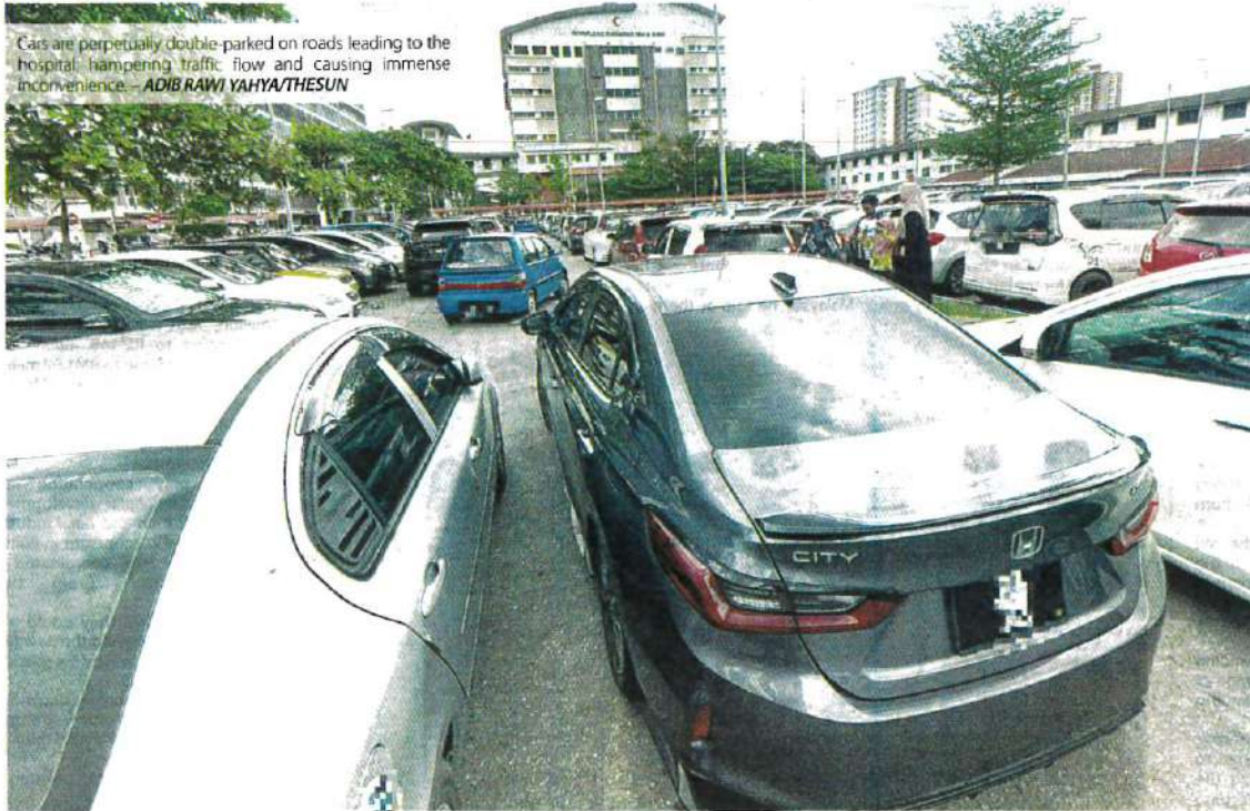
Cars are perpetually double-parked on roads leading to the hospital, hampering traffic flow and causing immense inconvenience.

AKHBAR : THE SUN MUKA SURAT : 1 RUANGAN : MUKA HADAPAN