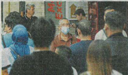
More people seen wearing masks in Kuala Lumpur yesterday.

"They both come with mild symptoms. But there's not been