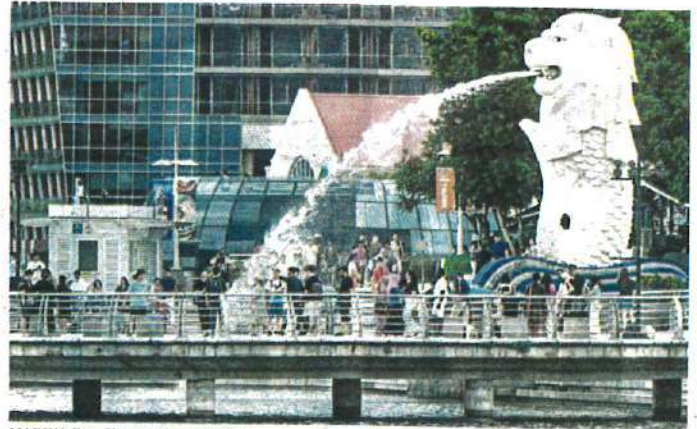
MARINA Bay, Singapura.

MOH berkata, anggaran jumlah kes Covid-19 pada minggu 5 hingga 11 Mei meningkat kepada 25,900 kes, berbanding 13,700 kes pada minggu sebelumnya. Purata kemasukan