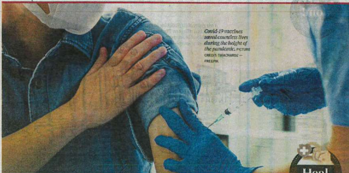
Covid-19 vaccines saved countless lives during the height of the pandemic.