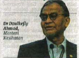
Dr Dzulkefly Ahmad, Menteri Kesihatan

"MOH menjejaki dengan teliti trajektori gelombang ini," kata Kementerian itu seperti dilaporkan portal berita CNA.