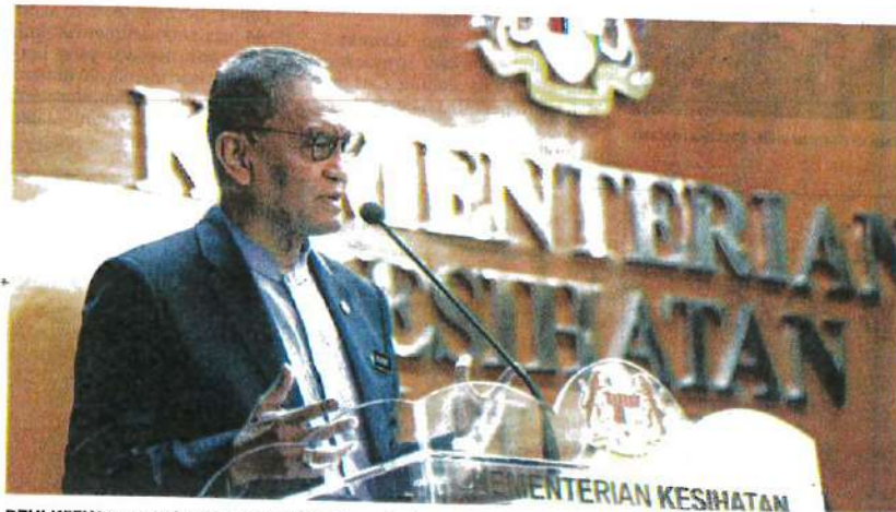
DZULKEFLY menyatakan dua sub varian baharu Omicron punca kes naik mendadak di Singapura.

AKHBAR : KOSMO MUKA SURAT : 6 RUANGAN : NEGARA