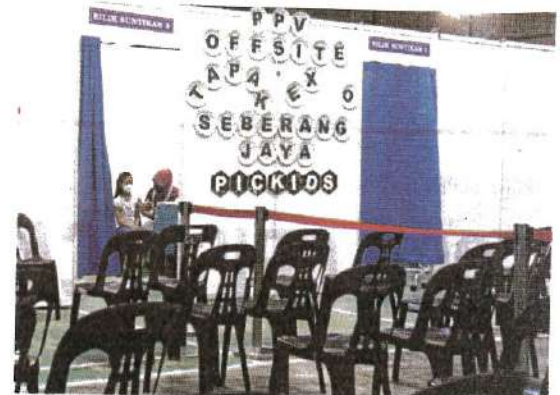
The empty waiting hall at the Seberang Jaya Expo vaccine delivery centre in Penang yesterday.