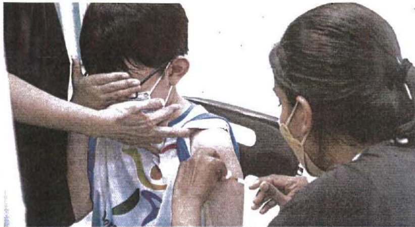
A boy closing his eyes as a health worker administers a Covid-19 vaccine at the Seberang Jaya expo grounds in Penang yesterday.