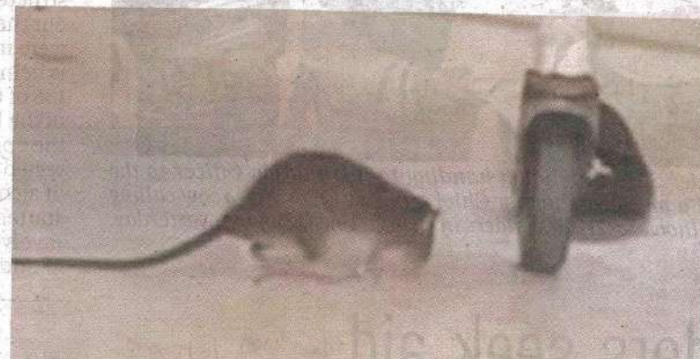
The rat making its rounds at Tuanku Ja'afar Hospital in Seremban.

concessionaires were instructed to find areas that had rats and put more traps.