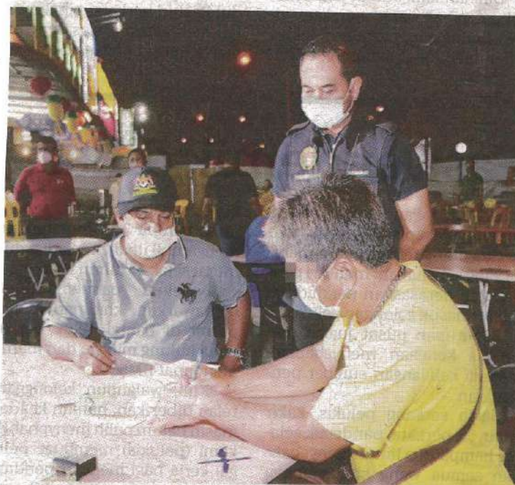
ANGGOTA penguat kuasa JKN Perak mengeluarkan kompaun kepada individu yang melakukan kesalahan merokok di tempat awam di Ipoh kelmarin.

Beliau berkata, sebagai rakyat Malaysia, semua orang sepatutnya mengambil tahu kewujudan peraturan kawalan hasil tembakau dan kawasan larangan merokok, malah akta itu telah lama diwartakan iaitu pada tahun 2004.