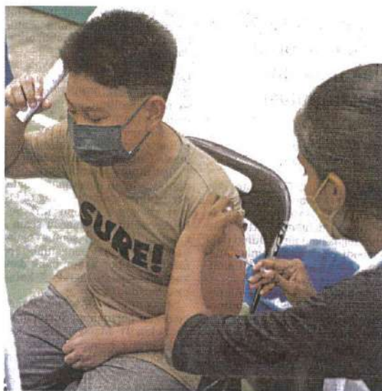
Seorang kanak-kanak menerima suntikan vaksin COVID-19 dos pertama sempena PICKids di Pusat Pemberian Vaksin Offsite Tapak Ekspo Seberang Jaya, semalam.

La menjadikan jumlah kumulatif dos vaksin yang diberikan kepada rakyat negara ini sebanyak 68,275,177 dos.