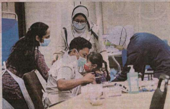
PETUGAS kesihatan memujuk seorang kanak-kanak untuk memberikan suntikan vaksin ketika Program PICKids di Putrajaya, kelmarin.

"Daripada jumlah keseluruhan 176 kes bagi kategori tiga hingga lima, 45 kes (25.57 peratus) tidak divaksinasi atau belum lengkap divaksinasi manakala 91 kes (51.70 peratus) menerima dua dos vaksin Covid-19 te-