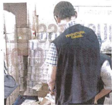
Pharmacy enforcement officers raiding premises selling bogus health products in 2019. FILE PIC

"With an increase in fines and the imposition of a jail sentence, many doctors will practice with the 'Sword of Damocles' hanging over their head, more so, when the powers of pharmacy enforcement officers are enhanced," he said in a statement yesterday.