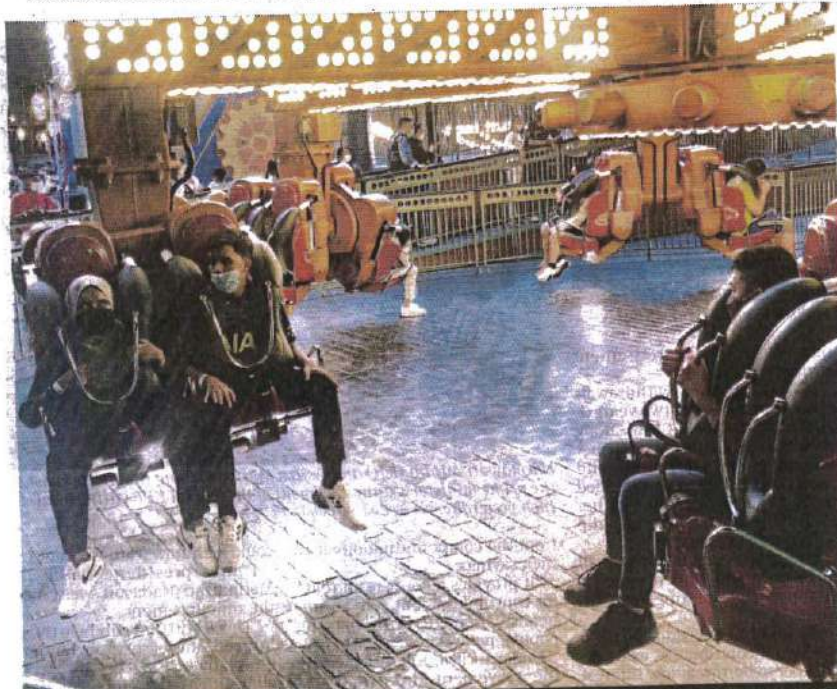
GOING FOR A SPIN

Up to yesterday, 1,197,667 children, or 33.7 per cent of the target, had received the first dose of the vaccine.