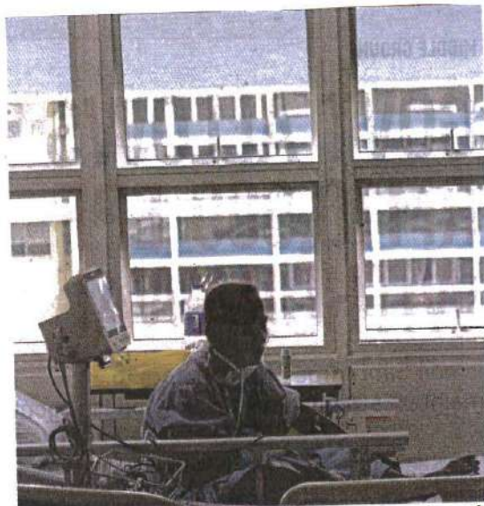
A Covid-19 patient being treated in Kuala Lumpur Hospital recently.

Kuala Lumpur topped the list at 81 per cent, followed by Putrajaya (67 per cent), Johor (64 per cent), Selangor (60 per cent), Kelantan (58 per cent), Perlis (55 per cent) and Melaka (50 per cent). But quarantine centres in all states