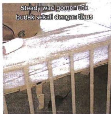
TANGKAP layar video yang tular baru-baru ini memaparkan seekor tikus dalam wad kanak-kanak di HTJ yang menimbulkan pelbagai reaksi orang ramai.

Difahamkan, aduan juga telah dibuat pihak yang merakam video berkenaan, namun didakwa tidak mendapat sebarang tinda-