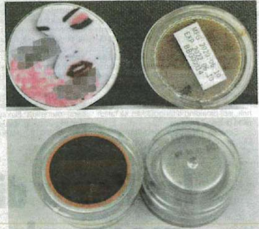
Empat produk kosmetik yang dikesan mengandungi racun berjadual.