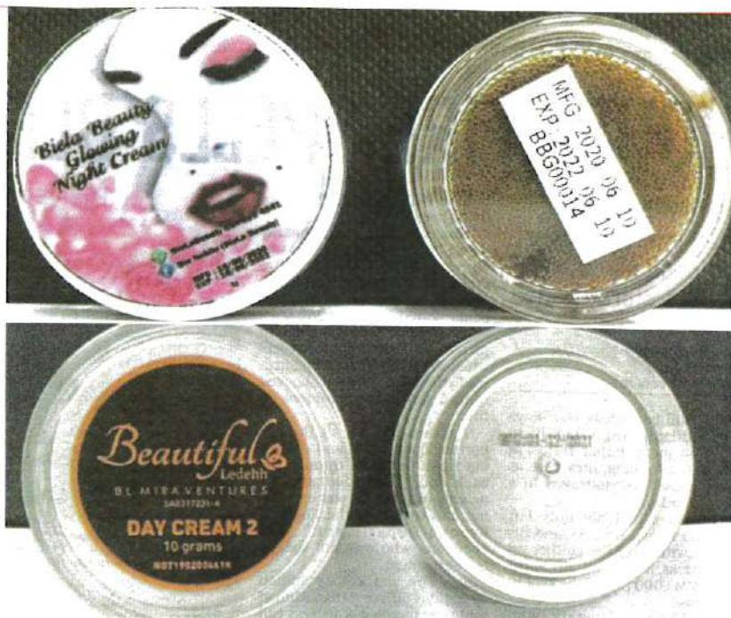
Biela Beauty Glowing Night Cream (top) and BL Skincare Day Cream 2 (bottom) are two of the four cosmetic products no longer allowed to be sold in Malaysia as they contain scheduled poisons.

He added that hydroquinone could cause redness on the part of the skin where it was rubbed, discomfort, unwanted skin dis-