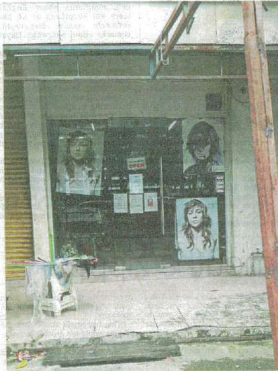
Beauty and the beast: The facade of a beauty salon which also offers dentistry courses.

"Any improper treatment can cause the patient to suffer conse-