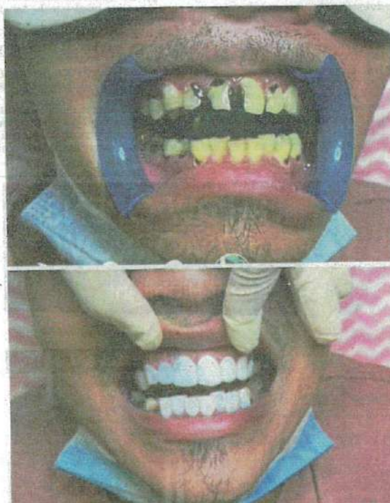
Superficial fix: Illegal practitioners normally would only provide 'cosmetic' treatment rather than treating the patient's actual condition. This eventually will lead to complications.

Fake dentists keep mouths zipped See next page