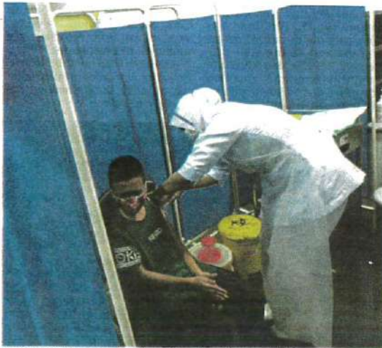
A child getting a Covid-19 vaccine at a clinic in Air Itam, George Town, last month. FILE PIC

He said the rate of samples testing positive for influenza-like illness in EW26 dropped by 21.7 per cent, and the positive rate of severe acute respiratory infection samples remained at zero per cent. Bernama