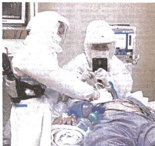
Sungai Buloh Hospital has treated 92,874 Covid-19 patients up to Wednesday.

Dr Noor Hisham said: "The ministry wishes to convey its highest appreciation to frontliners in the country, especially at Sungai Buloh Hospital, for their commitment to deliver the best healthcare services during the Covid-19 pandemic."