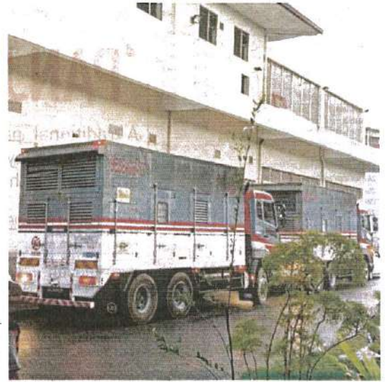
Sabah Electricity Sdn Bhd (SESB) mobile generator sets supplying power to Hospital Queen Elizabeth in Kota Kinabalu yesterday.