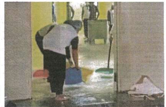
Hospital Queen Elizabeth II staff clearing water out from the hospital in Kota Kinabalu yesterday.